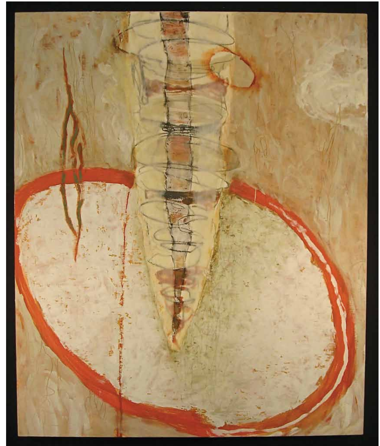
Fungus Tree 39" x 32" Encaustic, graphite, gouache, oil, pastel & mixed media on wood panel